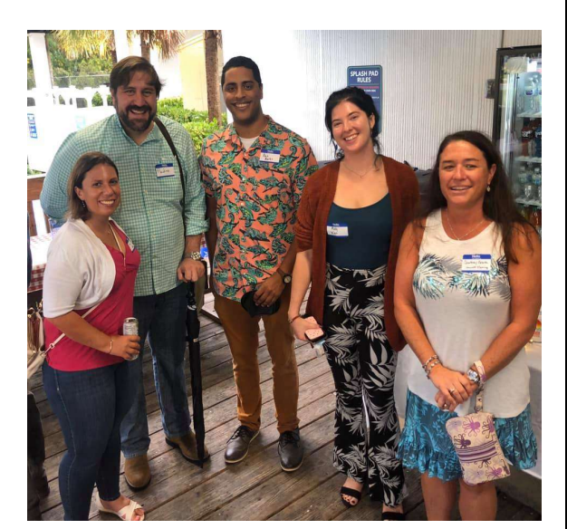
Conference Reception Attendees