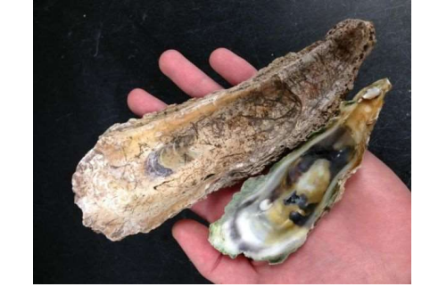
From Environmental News Network