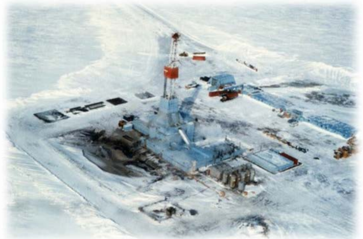
When the oil companies were finished with the test well, they hauled everything away — even, according to one account, the rock cuttings.

Click here to read the entire story from The New York Times Climate Forward Newsletter.