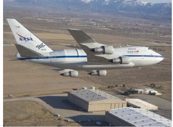
NASA's SOFIA infrared observatory 747SP overflies its home, the Dryden Aircraft Operations Facility in Palmdale, Calif.

And as a mobile observatory, it can fly anywhere, anytime. SOFIA can move into position to capture especially interesting astronomical events such as stellar occultations (when celestial objects cross in front of background stars), while ground-based telescopes fastened to the "wrong" geographic locations on Earth's surface miss the show. SOFIA will fly above the veil of water vapor 1 that surrounds Earth to take a wide-eyed look at the cosmos.